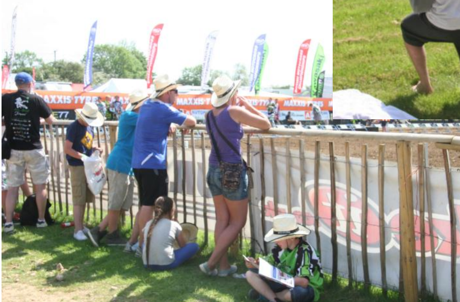
Left: DBG hats got around the track. This entire family sporting them.