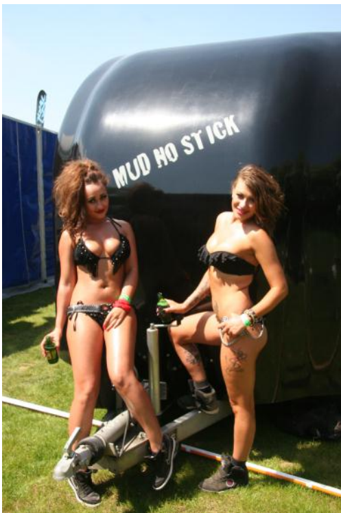
Will they be the MUD-NO-STICK promo girls for 2013 ?